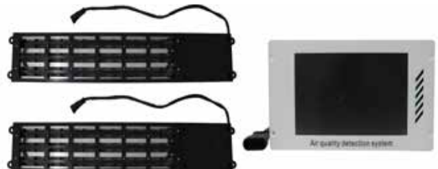
NBKJ-003-A (L&R, 2 pcs/set) ▲

Air purifiers use a 3-stage method of cleaning the air; negative ion, ultraviolet and photocatalyst. The electrostatic precipitator generates positive and negative ions which remove dust, pollutants and inhibit bacteria growth. UV sterilisation lamps effectively kill all types of bacteria and viruses, while Photocatalyst TiO 2 causes harmful gases, smells and viruses in the air to decompose.